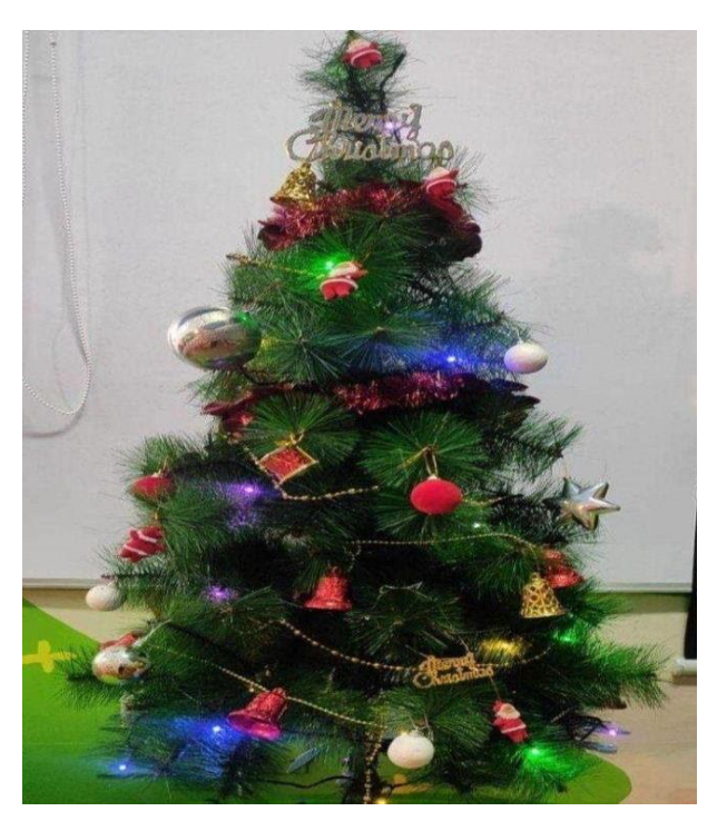
Christmas celebrations were held at the Samiksha Foundation Learning Centres.

Putting up a christmas tree brings a spirit of festivity, joy and hope. The children were engaged by our teachers to create their own little trees.