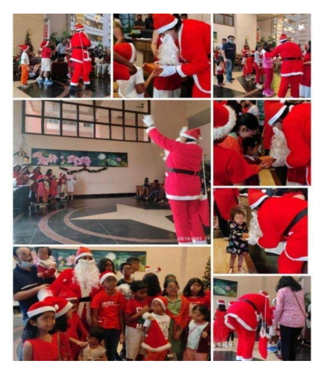
Samiksha Foundation held a fund raising event at the Jacaranda block of Brigade Millenium society, JP Nagar. This event was open to all residents of the Brigade Mellineum Society. After the gift distribution, there was a short cultural event of dance & music.