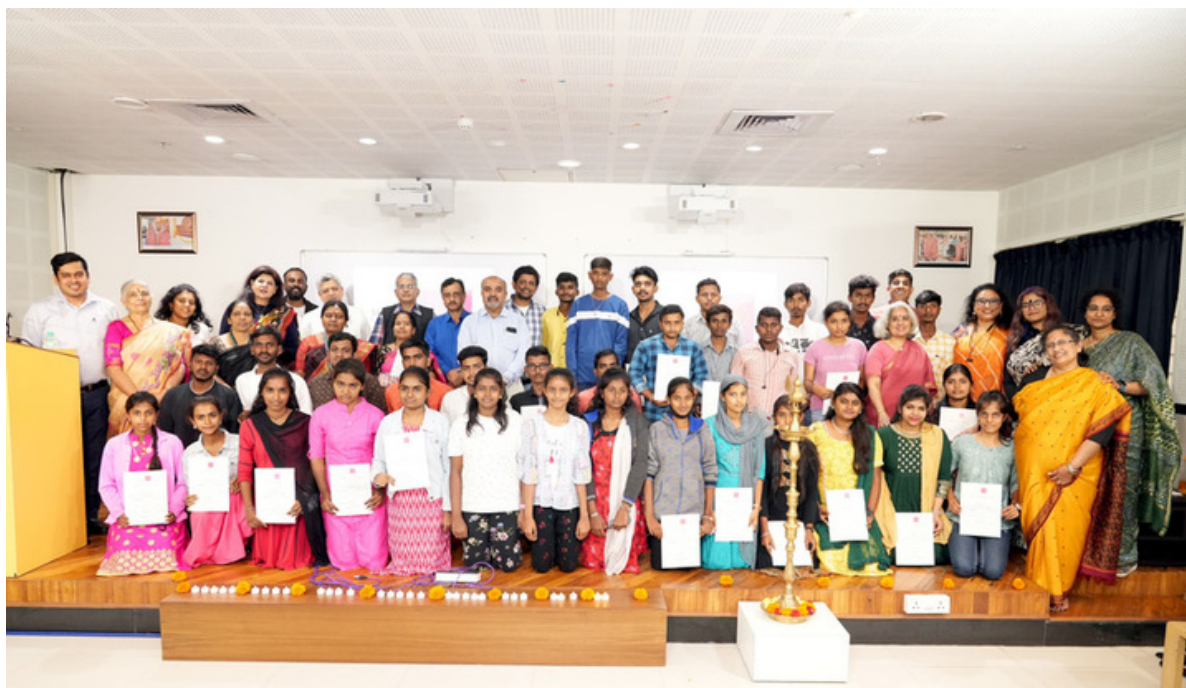
SFSP 7 awardees, staff, and patrons